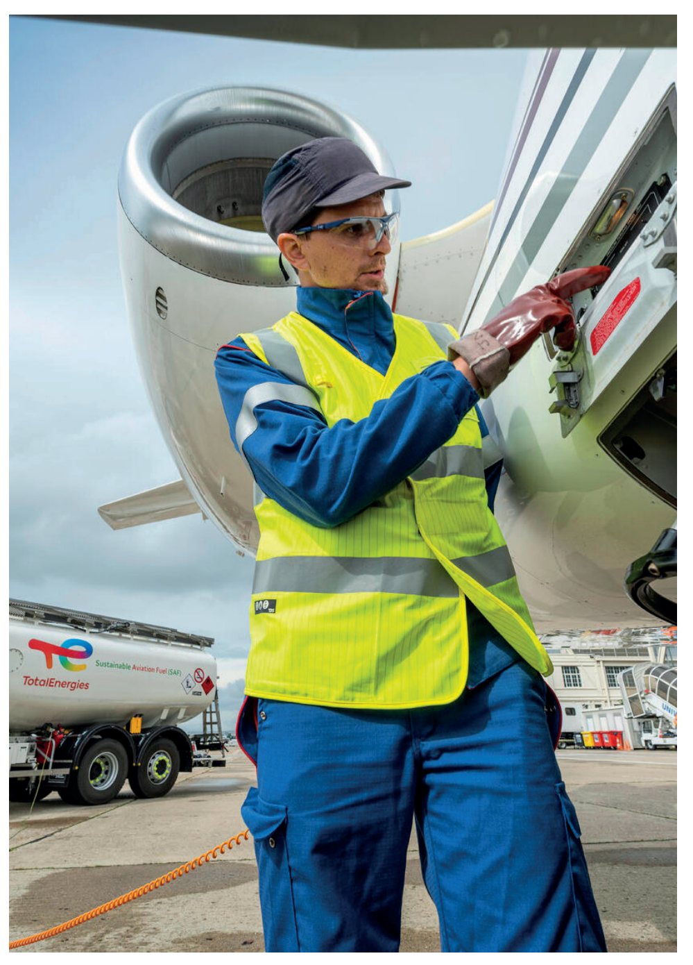
14 - 15