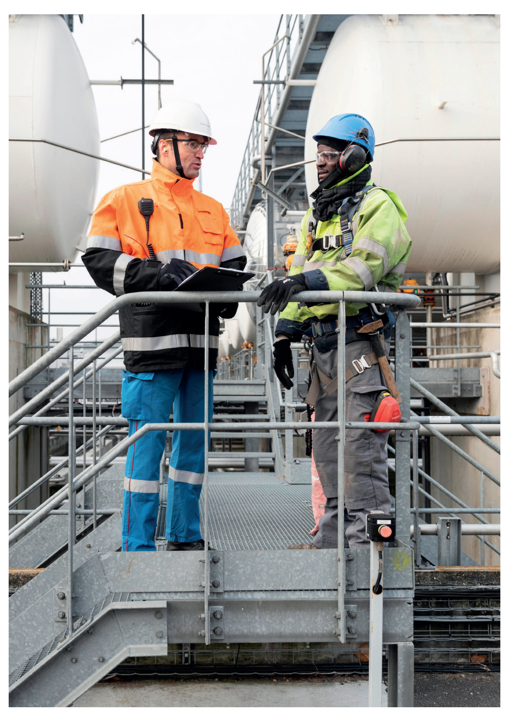
Joint Safety Tours - November 2021