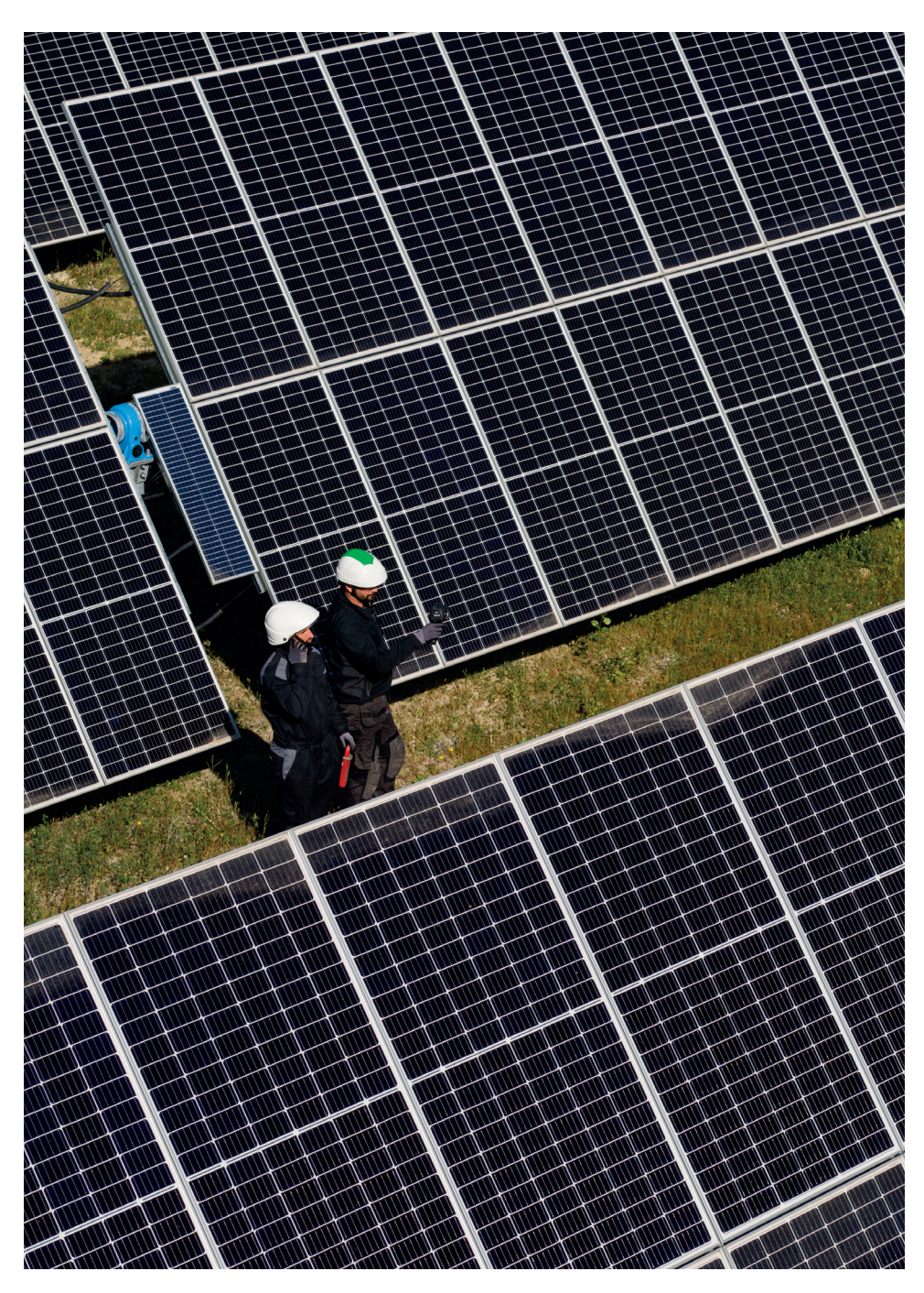
Joint Safety Tours - November 2021